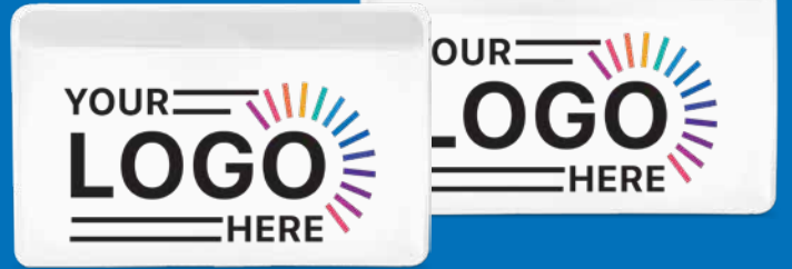
1201 MAGNIFIER/CREDIT CARD HOLDER Min. 200*